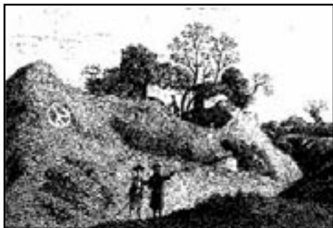
'IBM' operatives at 'Merdon' Castle ('1785')

We shall enter the realm of scenery at MERDON CASTLE . This stronghold of placeless Capital has been in the hands of 'freemasons' since its purchase by 'IBM' in '1960/61'. Beneath 'Hursley Park' and 'Merdon Castle', 'IBM' works to perfect the architecture of pan-global 'capitalism'. They hope to erect The Golden Stone , an apex , above Merdon Castle (symbolising 'extension') at the moment of 'millennium', whilst attention is focused on the Greenwich meridian.